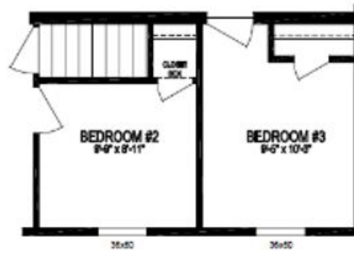
OPTIONAL BASEMENT STAIRWELL