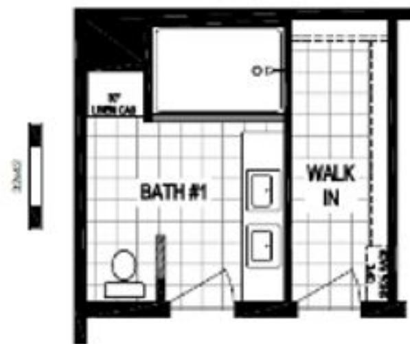
OPTIONAL MASTER BATH w/ 72" CERAMIC SHOWER