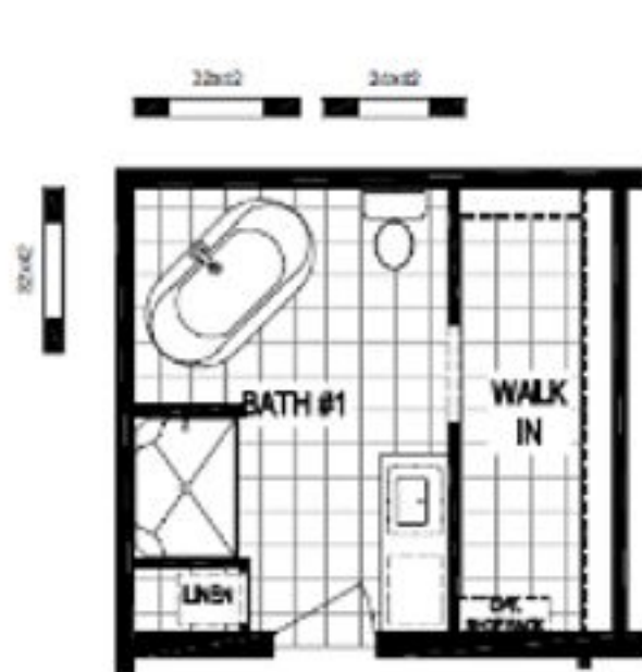
DELUXE BATH OPTION "A"

NOTE: HUD HOMES THAT HAVE A GAS WATER HEATER AND A 5/12 ROOF PITCH WILL REQUIRE AN "SC" ON SITE INSPECTION