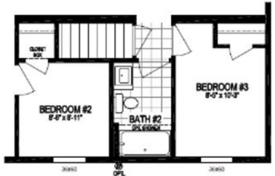
OPTIONAL BASEMENT STAIRWELL