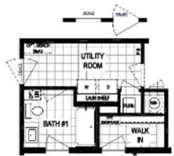
OPTIONAL END ENTRY

NOTE: DOORS MARKED WITH A * CANNOT HAVE THE HUD PER-SHADE SYSTEM AND WILL NEED PERIMETER BLOCKS OR ADJUSTABLE OUTDOORING (ON SITE IF LOCAL CODE ALLOWS)